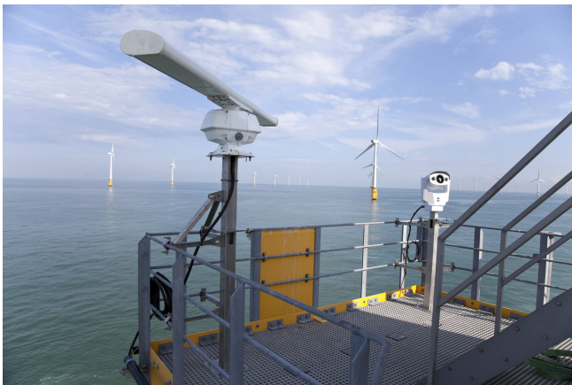
MUSE radar-camera unit on turbine platform (Thanet Offshore Wind Farm, ORJIP project).

Since 2007, we have developed and applied a range of radar applications to Environmental Impact Assessments (EIAs) and monitoring related to wind turbine and other infrastructure projects. One of the major challenges in measuring movements and behavioural reactions of birds within and around wind farms is to collect accurate information 24-7 at the species level in an efficient way. DHI have developed techniques to circumvent these challenges. We can now integrate automated tracking with identification of flying birds based on a combination of radar and digital camera recordings.